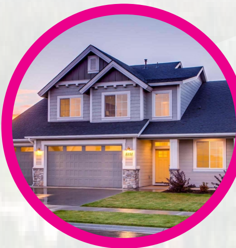
Rent collection Letting vacant houses

We invite you to explore our comprehensive range of services tailored to meet your every need: