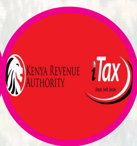
Filing income tax